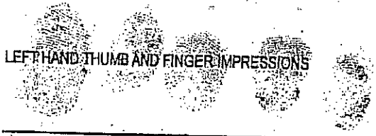
LEFT HAND THUMB AND FINGER IMPRESSIONS

I do not consider this disqualification for employment in the office of the DEO (CF) Kohat His age according to his own statement (43) yrs year and by appearance about year (43) yrs